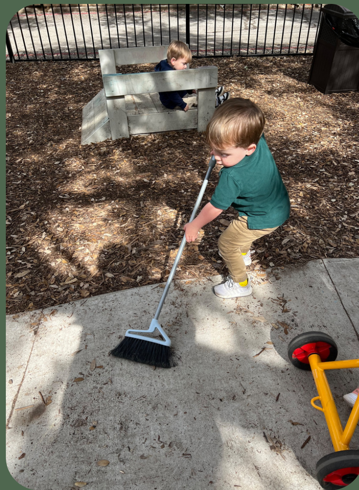
Outdoors 11:30 – 12:30