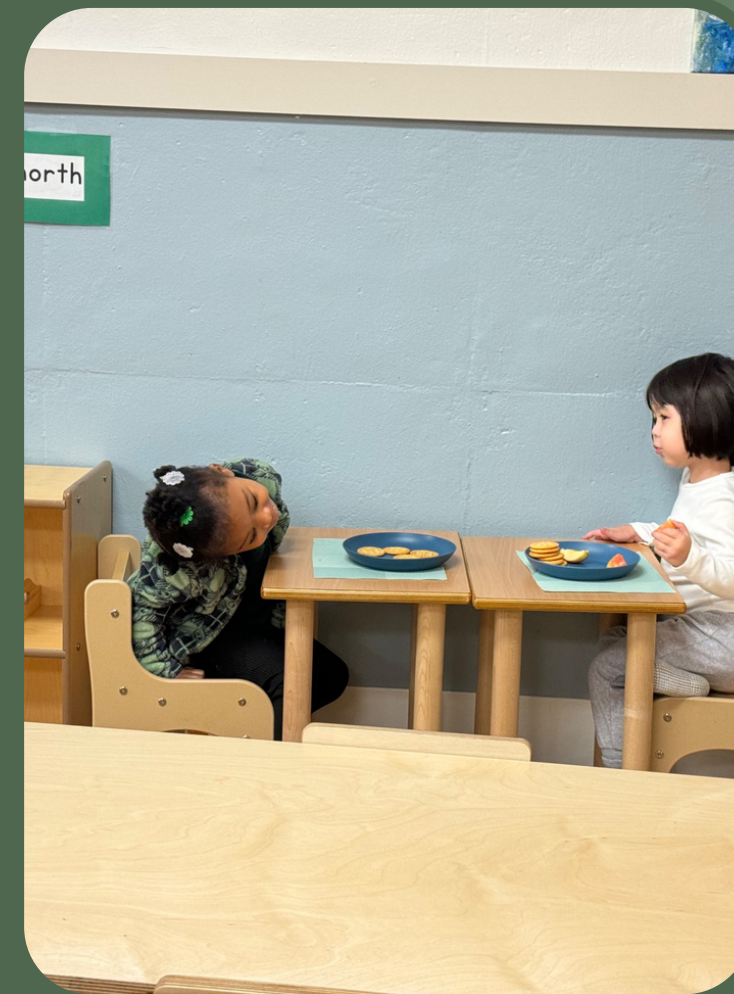
Lunch 12:30 – 1:00