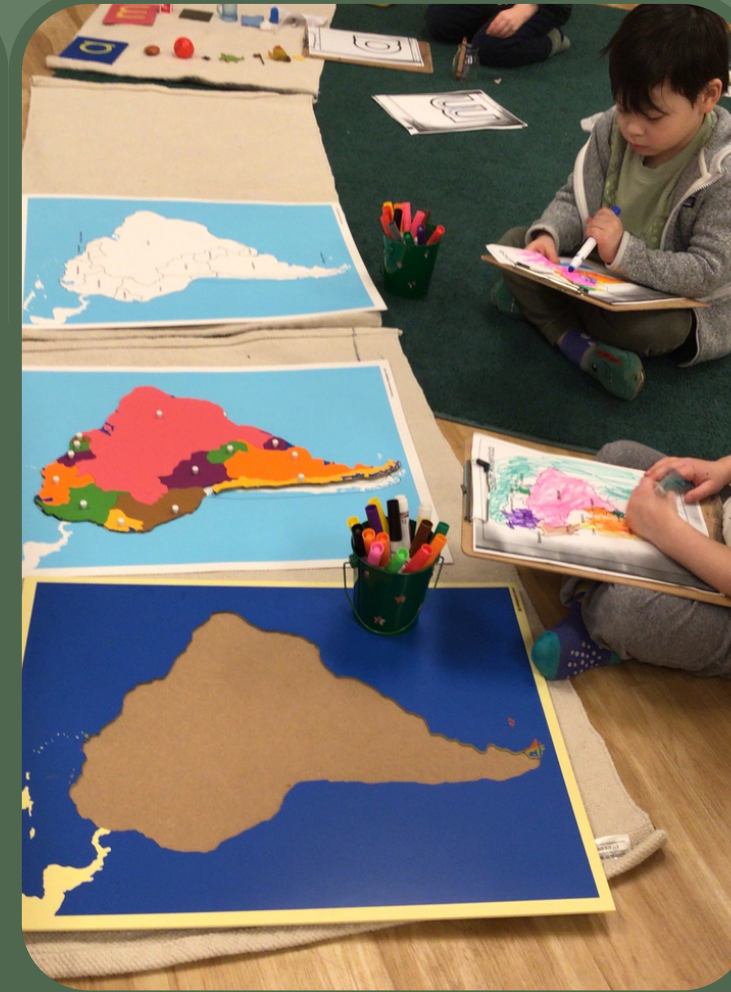
Cultural (Science/ Geography)