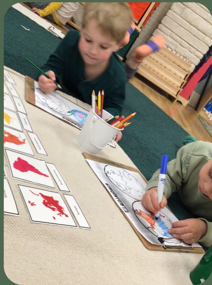
Work Cycle 8:30 – 11:30