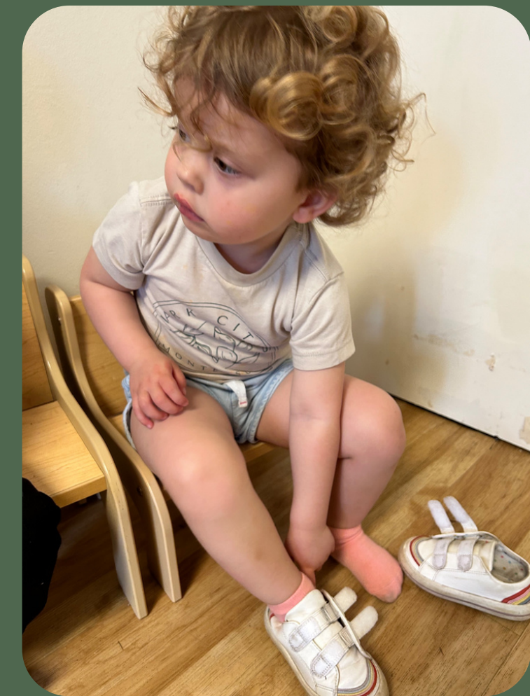
Arrival 7:30 – 8:30

Children should arrive by 8:30 AM to ensure they are able to get their full 3 hour work cycle accomplished each day. Children that are 4 or older are offered a PM work cycle as well after a 30 minute rest.